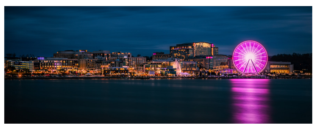
Washington DC Premier Dinner Cruise Pier 4 – The Wharf District Friday, May 2nd 6:00 pm 10:00 pm

This upscale evening on the Potomac River features a chef-prepared plated meal, craft cocktails*, and exceptional service. You'll soak in sweeping views of Washington, DC's iconic landmarks, such as the Washington Monument and Lincoln Memorial from the warm and comfortable indoor areas and the open-air decks while our live DJ plays all your favorite hits.