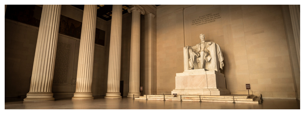
Historic DC Landmarks Trolley Tour HISTORIC TROLLEY TOURS Saturday, May 3rd 10:00 am – 1:00 pm

Cost : Included with Spouse/Guest registration fee. For others, the fee is US $130.